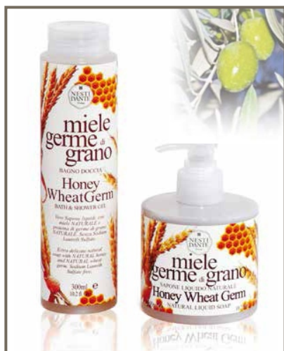
HONEY WHEAT GERM with active ingredient of Honey and Wheat Germ Protein.

Natural Liquid Soap with 100% Olive Oil 10.2 fl Oz Versions: Bath Liquid Soap; Hand Liquid Soap; it does not contain either Sodium Laureth Sulphate or other synthetic surfactants.