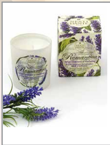
Wild Tuscan Lavender and Verbena (Energizing)