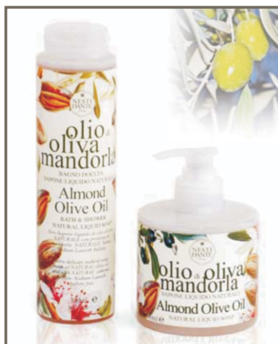
ALMOND OLIVE OIL with active ingredient of Sweet Almond Protein and Olive Oil Extract.