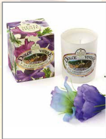
Portofino (Sea Flower)

Hand made scented candle prepared with natural, biodegradable, vegetable wax. Vegan friendly, no animal ingredients-ever. Cruelty-free. 100% cotton wick, lead free. Up to 30 hour burn time.