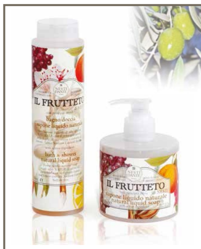
IL FRUTTETO with active ingredient of Red Grapes Leaves and Lemon Extract.