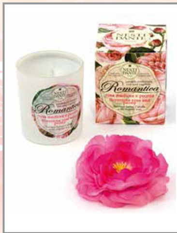
Florentine Rose and Peony (Romantic)